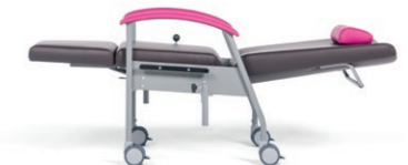
Bed position/Flat position