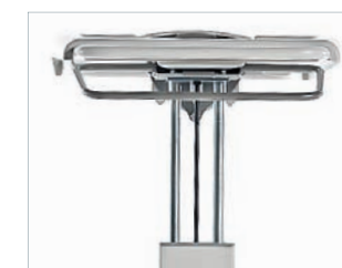
Height adjustment with dual control

Perfect for combining with the MULTILINE NEXT DC and IT (IT shown here)