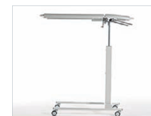
Design and quality made by GREINER