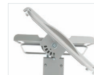
Swivelling tray (BT plus)