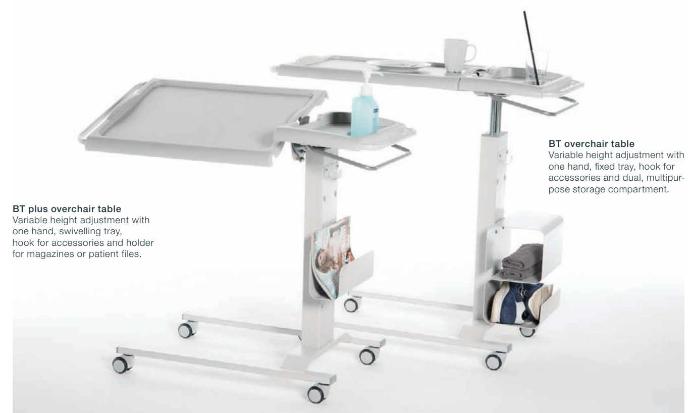
BT overchair table Variable height adjustment with one hand, fixed tray, hook for accessories and dual, multipurpose storage compartment.