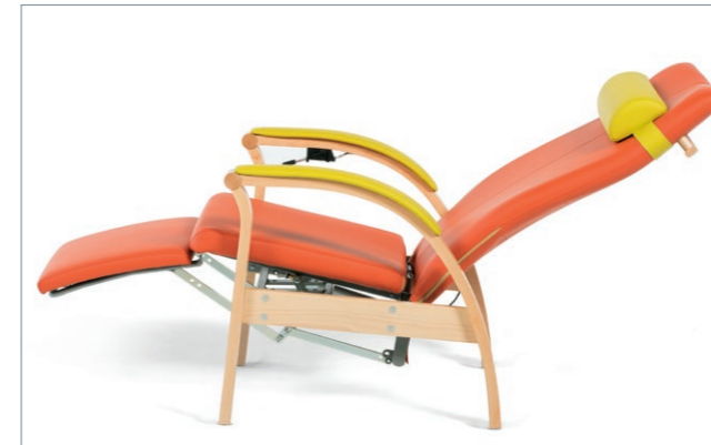
RELAX without side panels in resting position