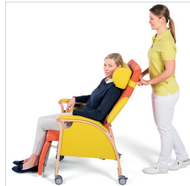
Mobility with RELAX in nursing

The RELAX relaxation chair ensures all-round comfort. The backrest and legrest are continuously and synchronously adjustable to about 50° from the neutral position, with the option of electrical or manual adjustment via a gas spring. In addition, it is possible to separately adjust the leg section by up to 90°. In the relaxed position, the seat cushion rises at the front by 10°, thus preventing the seated person from slipping. The rocking function is particularly relaxing and is easily operated using the adjustment lever under the armrest. The seat cushion and cover are removable. The shape of the armrest provides safety and comfort in reclining position. RELAX is available as a fixed version and as a mobile version on double castors. These can be locked on the rear side.