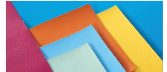
Versatile colour variants in the cover fabrics compact and premium