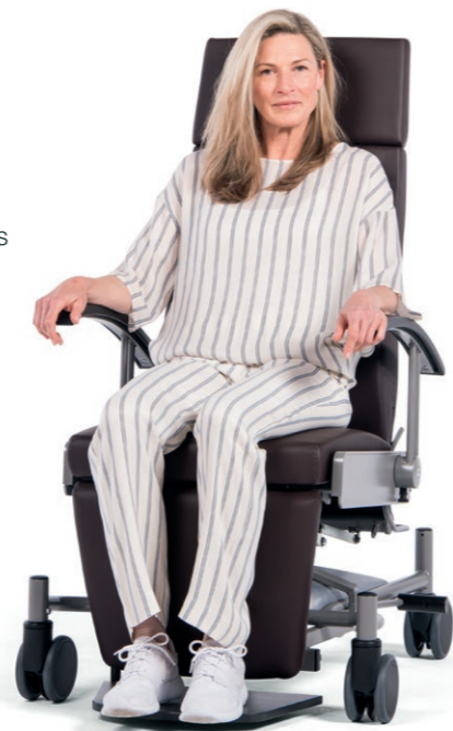
CareLine. Care and mobilisation chair. See website.

A good seat makes a lot of things easier – pure relaxation is quality of life. Sitting and lying comfortably for shorter and longer periods during an active daily routine contributes greatly to well-being and satisfaction for older people in care. At the same time, satisfied residents and patients enormously reduce the load on nursing staff. People need care for various reasons: after a long time in hospital; when they find it difficult to cope alone; when their mental powers diminish. In many areas of modern care facilities, GREINER recliners and relaxation chairs create a new form of home and nursing culture in an appealing ambience. The spectrum ranges from day care via assisted living to geriatric care – from rest and relaxation to mobilisation and transport.