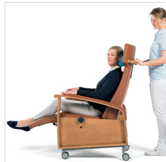
Mobility with RELAX 2 in nursing

In the form of an armchair, RELAX 2 impresses with a completely new technology for backrest and legrest adjustment using two gas springs, which allow both synchronous adjustment of the lying surface and separate adjustment of the legrest in every position. The electrically adjustable version is equipped with 2 motors. A powerful battery guarantees the required mobility. Extension of the adjustable backrest into the horizontal lying position, the visco-elastic foam embedded in the upholstery and the ergonomic design offer maximum comfort while seated or lying down. The side panels made of beech wood, polished with polyurethane-based varnish and suitable for wipe disinfection, are attractively stained in the shade Havana. The broad sweep of the armrests beyond the backrest offers complete support of the arms even when lying down and makes it easier to get up from the resting position. 75 mm swivel castors, lockable at the rear, and an ergonomically fitted push handle (accessory) facilitate mobility for the nursing team.