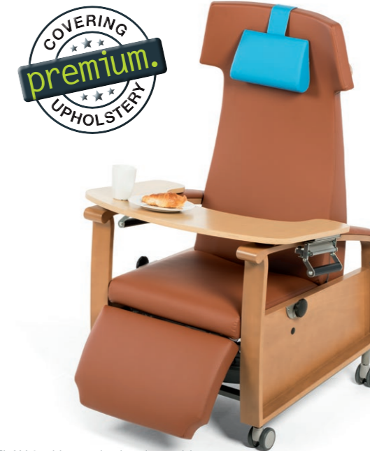
RELAX 2 with attached patient table