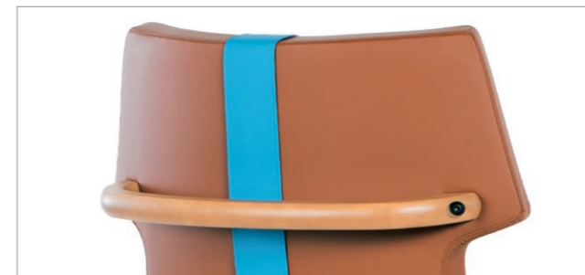
Ergonomically fitted push bar (accessory)