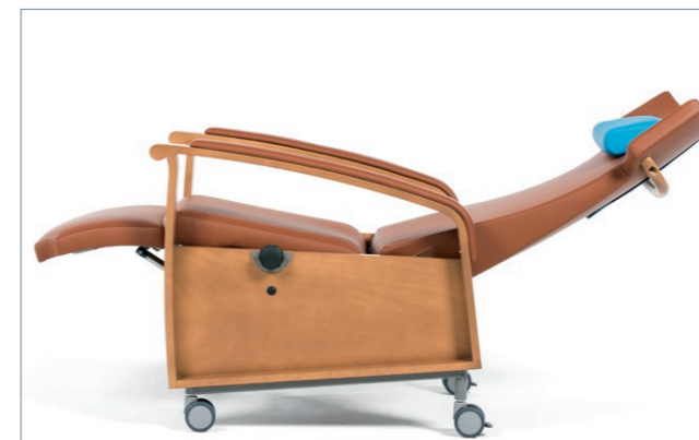
RELAX 2 without side panels in the resting position