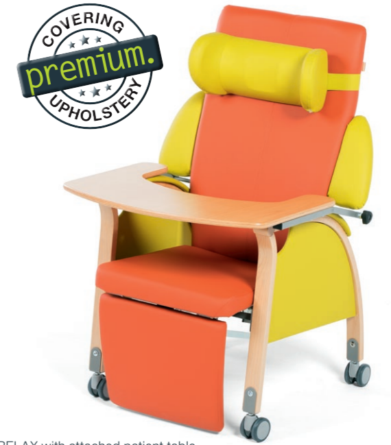
RELAX with attached patient table