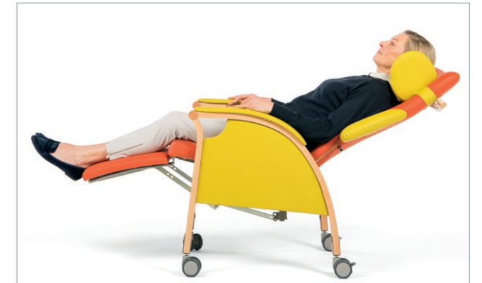
A feel-good atmosphere with RELAX in nursing homes or in hospitals