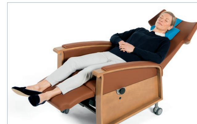
Feel-good atmosphere with RELAX 2 in nursing homes or in hospitals