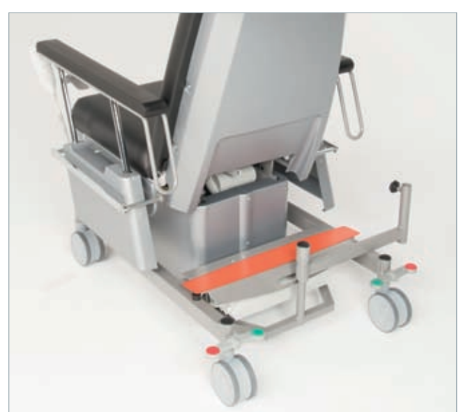
Ease of access to powerful rechargeable battery