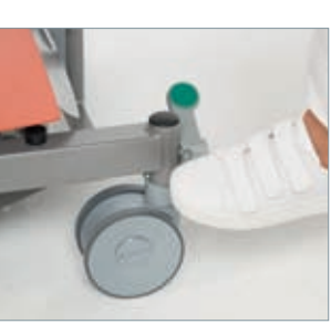
Central locking/directional stability