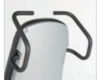
Handles for seated/reclined position