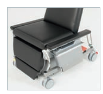
Fully retractable armrests