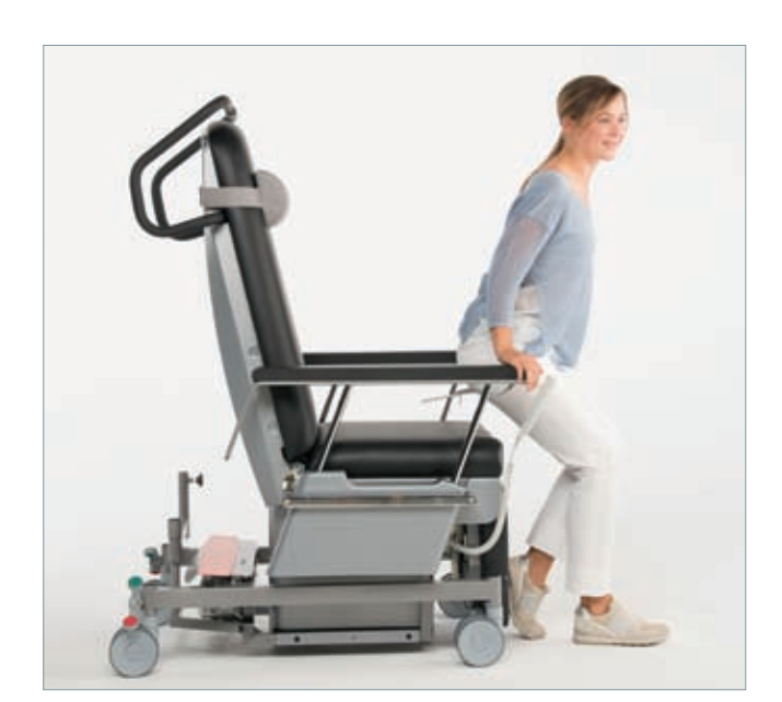
Patient-friendly access at heights of 58-90 cm

GREINER gives you the opportunity to individualise treatment couches according to your precise needs. For example, you can choose your preferred upholstery colour from the broad colour chart. Covering materials, which have a biocompatible surface, are resistant to urine and blood, scratch-proof, heat resistant and impervious to disinfectants and soiling. Equipment and accessories are designed with attention to detail.