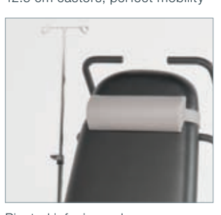
Pivoted infusion pole